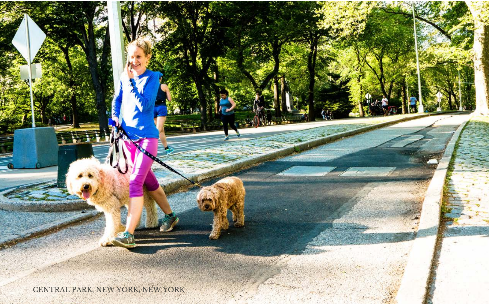
CENTRAL PARK, NEW YORK, NEW YORK

MELS LOVE LAND OFFERS A BRIDGE INVITING PEOPLE TO CONSIDER THE POSSIBILITY THERE IS ANOTHER WAY TO LOOK AT ANY SITUATION, CIRCUMSTANCE OR EVENT THAT COMES UP WITH LOVE.