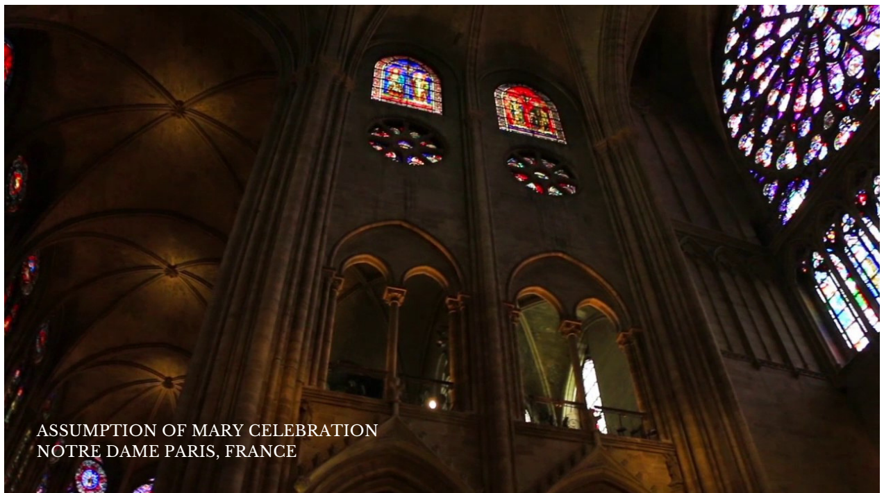
ASSUMPTION OF MARY CELEBRATION NOTRE DAME PARIS, FRANCE